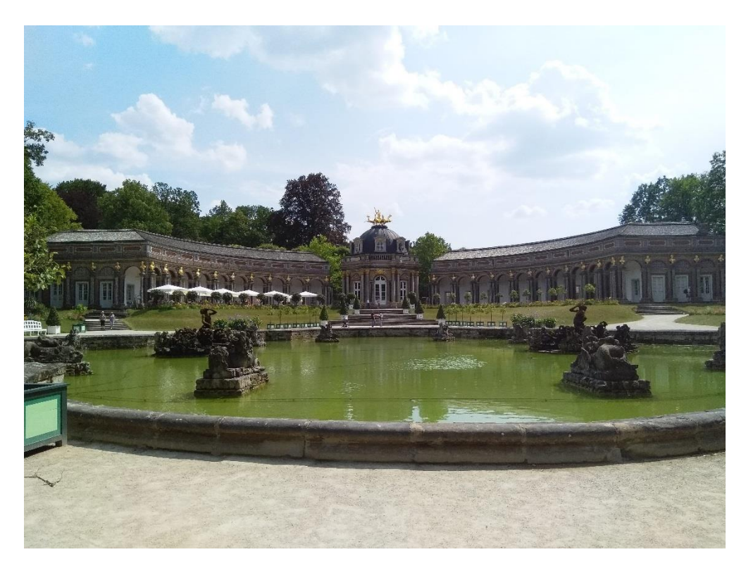
Orangerie mit Sonnentempel, Eremitage Bayreuth, eine barocke Parkanlage

After finishing my exchange time I was able to travel a little through Germany, Belgium and Holland. I knew the cities of München, Nürnberg and Berlin. In Munich I visited the city's Botanical Garden. It was also impressive for me to walk through those gardens. In Nürnberg I attended a music festival (whose name I don't remember) and from there I travelled to Breda, in the Netherlands, to meet a friend who works as a volunteer in the Kalmthout Arboretum, in Belgium. I stayed at her house in the village of Essen, very close to the border between Belgium and Netherlands. On the last day of this part of the trip, I returned to Breda to board my bus to Berlin. I walked a few hours through Breda.