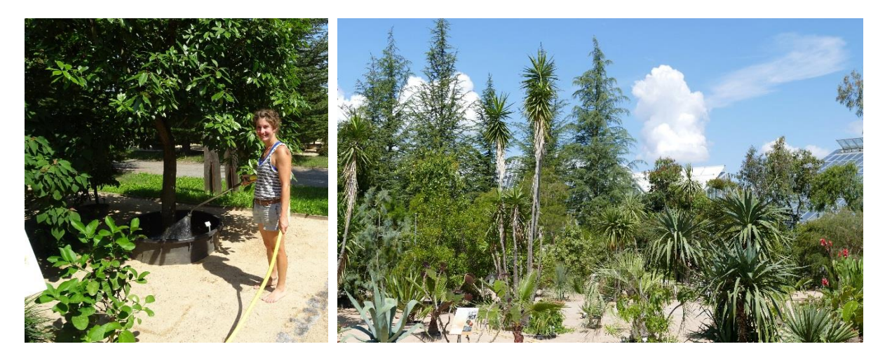
Eine Arbeitskollegin beim Wässern der Kübelpflanzen

Die Sandfläche mit den tropischen, subtropischen und mediterranen Kübelpflanzen