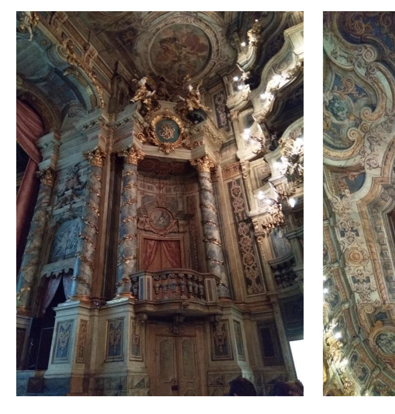
Innenansichten des Markgräflichen Opernhaus Bayreuth, eine UNESO Weltkulturerbestätte

About the human quality I could find in the Botanical Garden I must say that never before have felt so welcome. Everyone was always willing to help me. They responded to my concerns with kindness and clarity. I always got help when I needed it. I can say - though it may sound exaggerated - that the time I worked at the Botanical Garden of the University of Bayreuth has been one of the best experiences of my life. To whom it may concern, I thank you.