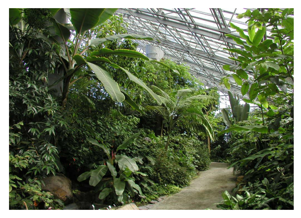
Blick ins Tropenhaus des Ökologisch-Botanischen Garten

The second place in the Botanical Garden where I worked was the tropical greenhouse. Here I also collected organic material and helped with pruning. I also helped in the nursery of this section to fertilize.